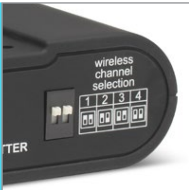
Select channels for up to 4 independent systems