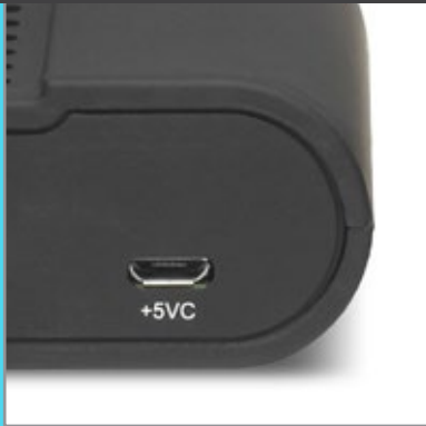
USB for Power