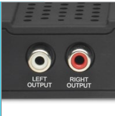
Simple RCA input/output