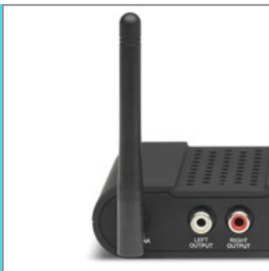
External antenna for increased range